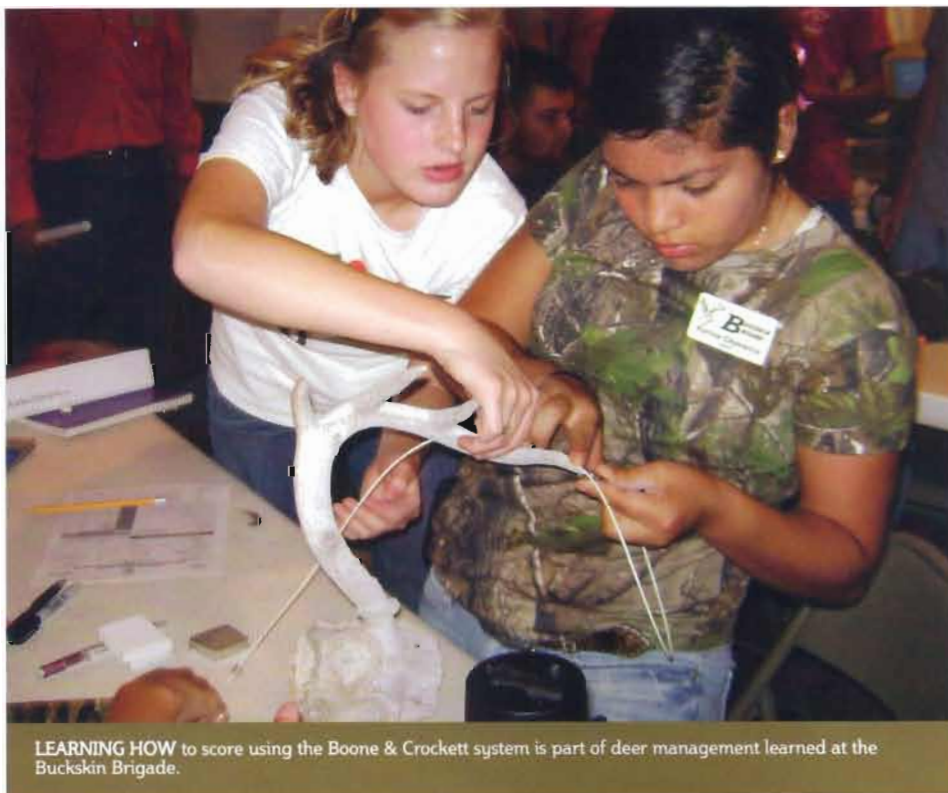
LEARNING HOW to score using the Boone & Crockett system is part of deer management learned at the Buckskin Brigade.

Tell me, and I forget. Show me, and I remember. Involve me, and I understand. – Texas Brigade Motto