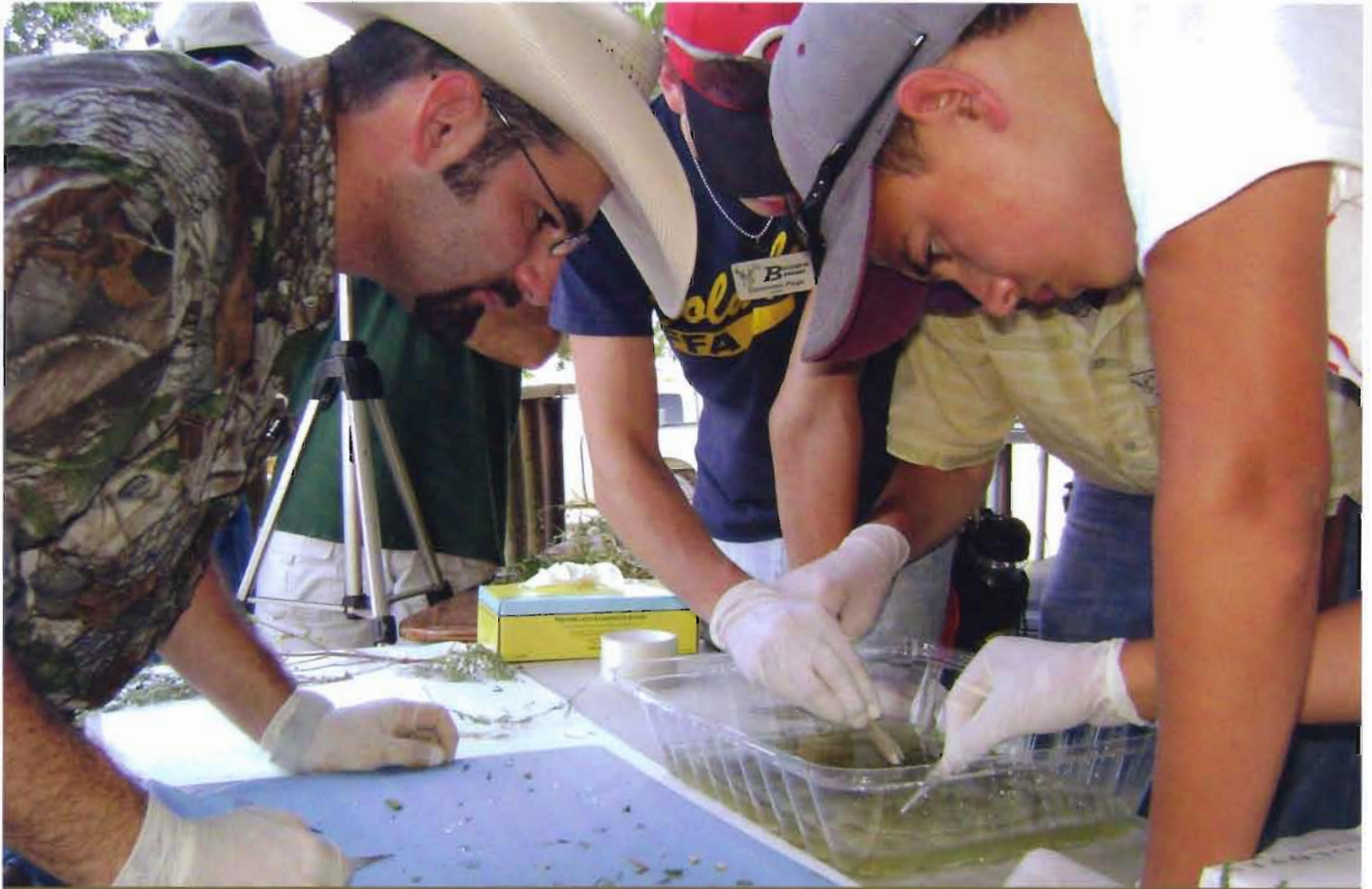
LEARNING TO IDENTIFY plants is tough. Learning to identify stomach contents is tougher. But it is important for a wildlife manager to know what wildlife eat.

Almost 20 years later, 1,800 young Texans and several from out-of-state have graduated from the program.