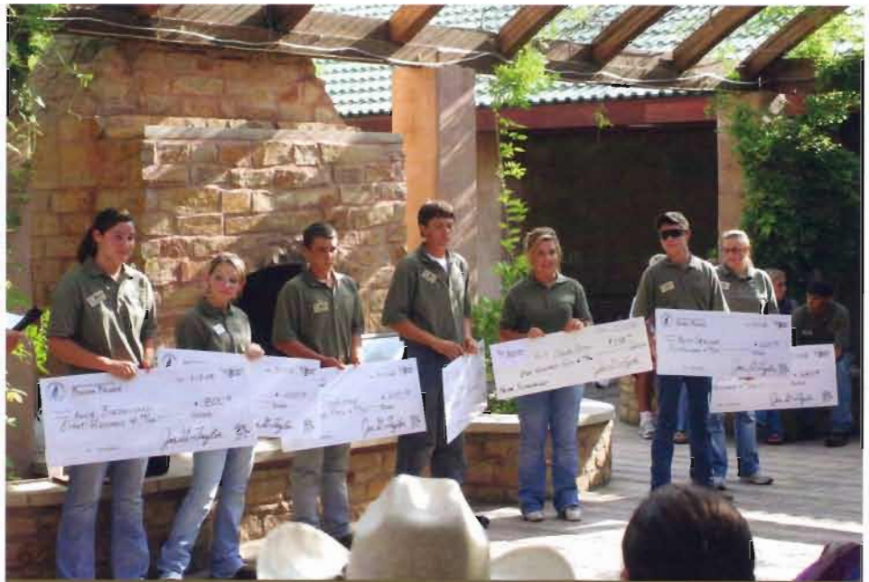
EXCELLENCE IS REWARDED at the Brigades. Those graduates who go home and spread the word about conservation receive college scholarship monies and the opportunity to serve as Assistant Leaders.