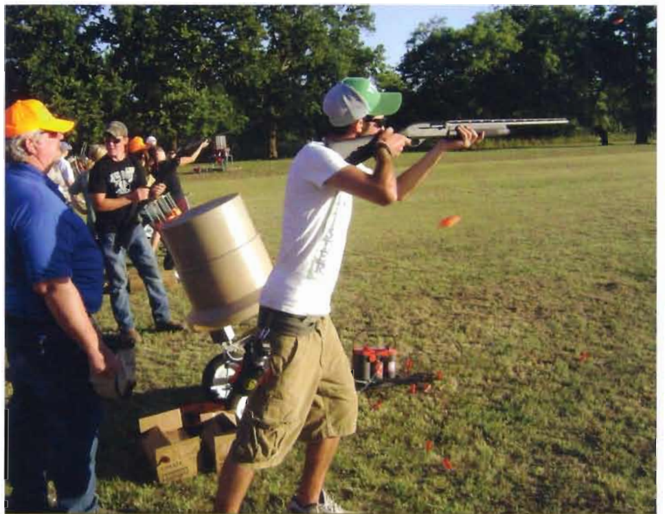
MANY YOUTHS have never shot a shotgun. All Brigade participants receive safety instruction prior to taking their first shot.

For those interested in a career in the natural resources, meeting the professionals currently working in the industry may lead to internships and employment after college. Even those who pursue careers in other fields walk away more confident, well-spoken, and informed.