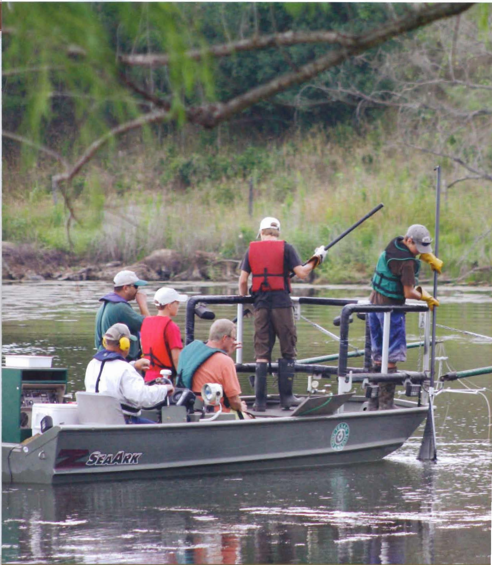
UNDER THE GUIDANCE of Texas Parks and Wildlife Department personnel, cadets participate in electroshocking to learn how biologists conduct fish studies.